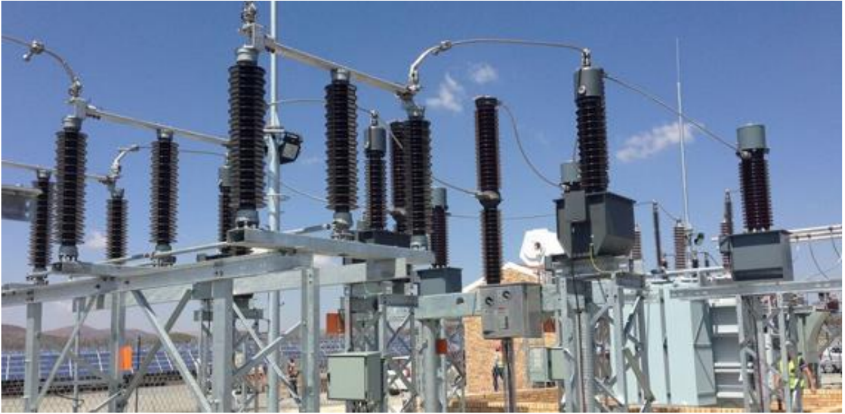
Solar substation render in Kajiado county

We integrate rigorous evaluation and monitoring services with high-quality and on-demand analytical, capacity building, and knowledge management solutions. We seek to inform policies and improve program investments for various developments, diplomacy, and security.